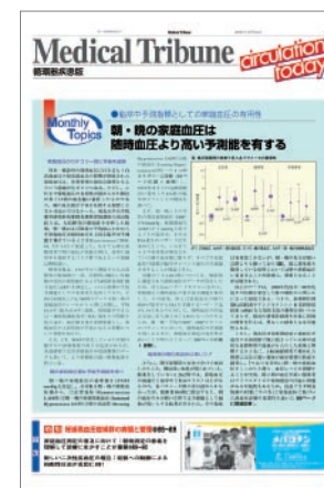
circulation today published on the 4th Thursday of every month A regular supplement to the Medical Tribune dealing with circulatory illnesses