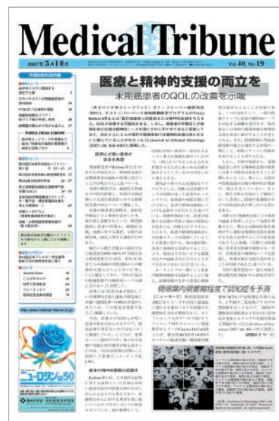
Medical Tribune published on Thursday of every week Japan's top medical newspaper

Business Specialized publishing in fields of medicine and medical treatment