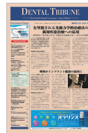
DENTAL TRIBUNE Published monthly Major media in the field of dentistry