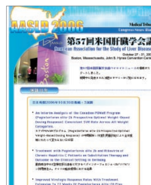
Web reports on international conferences